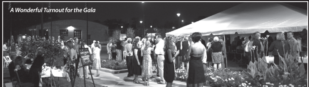
A Wonderful Turnout for the Gala