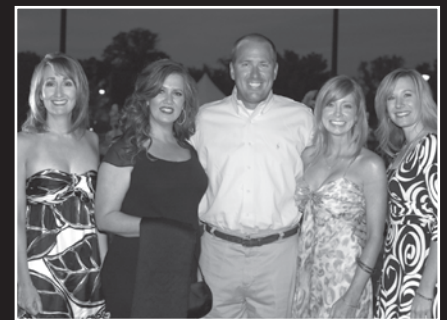
A Night to Remember

For the third year in a row, the Barren River Area Child Advocacy Center provided services to more than 500 children and their non-offending family/caregivers during its fiscal year. In the face of dwindling funding at all levels but increasing demand for specialized services, the Center had to find new ways to raise the funds and resources needed to continue its important mission. The Summer Lights Gala will continue to be a fun way to come out and support those efforts.