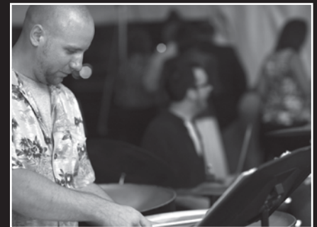
WKU Steel Drum Band

The First Annual Summer Lights Gala to benefit the Barren River Area Child Advocacy Center was held on Friday evening, September 19 th at the new Circus Square Park in downtown Bowling Green. As summer came to a close, it was a wonderful opportunity to spend an evening under the stars, listen to the sounds of a steel drum band and enjoy a Caribbean style fare all while helping to raise public awareness and funds to support the continuation of critical service provision to victims of child sexual abuse in the ten counties of the Barren River Area. The event featured a cocktail party and silent auction and then dinner and dancing. The Summer Lights Gala raised more than $50,000 in sponsorships and contributions to benefit the Center.